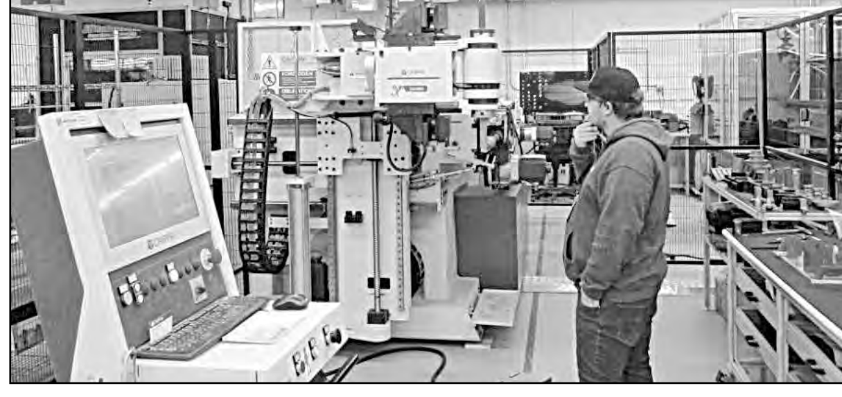
New technologies are expanding and one of Unison's ignition systems, made in Norwich, will help take people into space and travel far from Earth.

She said the suppliers may have gone through changes after COVID by letting some employees go during that time when volume was low. Now demand has returned but not the