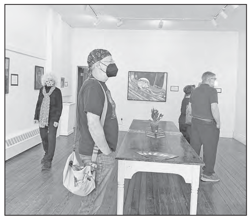
Attendees at the Earlville Opera House's 50th Anniversary Retrospective Gallery Exhibit. The gallery featured past artists who have showcased their work at the opera house as part of their celebration of the EOH's 50th anniversary as a nonprofit multi-arts center.