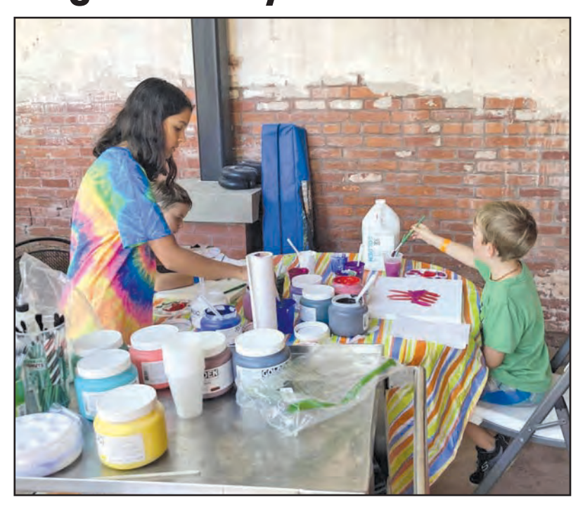
Children participating in Afternoon Art at the Earlville Opera House. In addition to hosting gallery exhibits and musical performances, the EOH provides educational opportunities surrounding the arts for all ages.

To plan performances and gallery exhibits for their 50th year, EOH staff looked to the past to find musicians and artists who have been a part of the opera house's