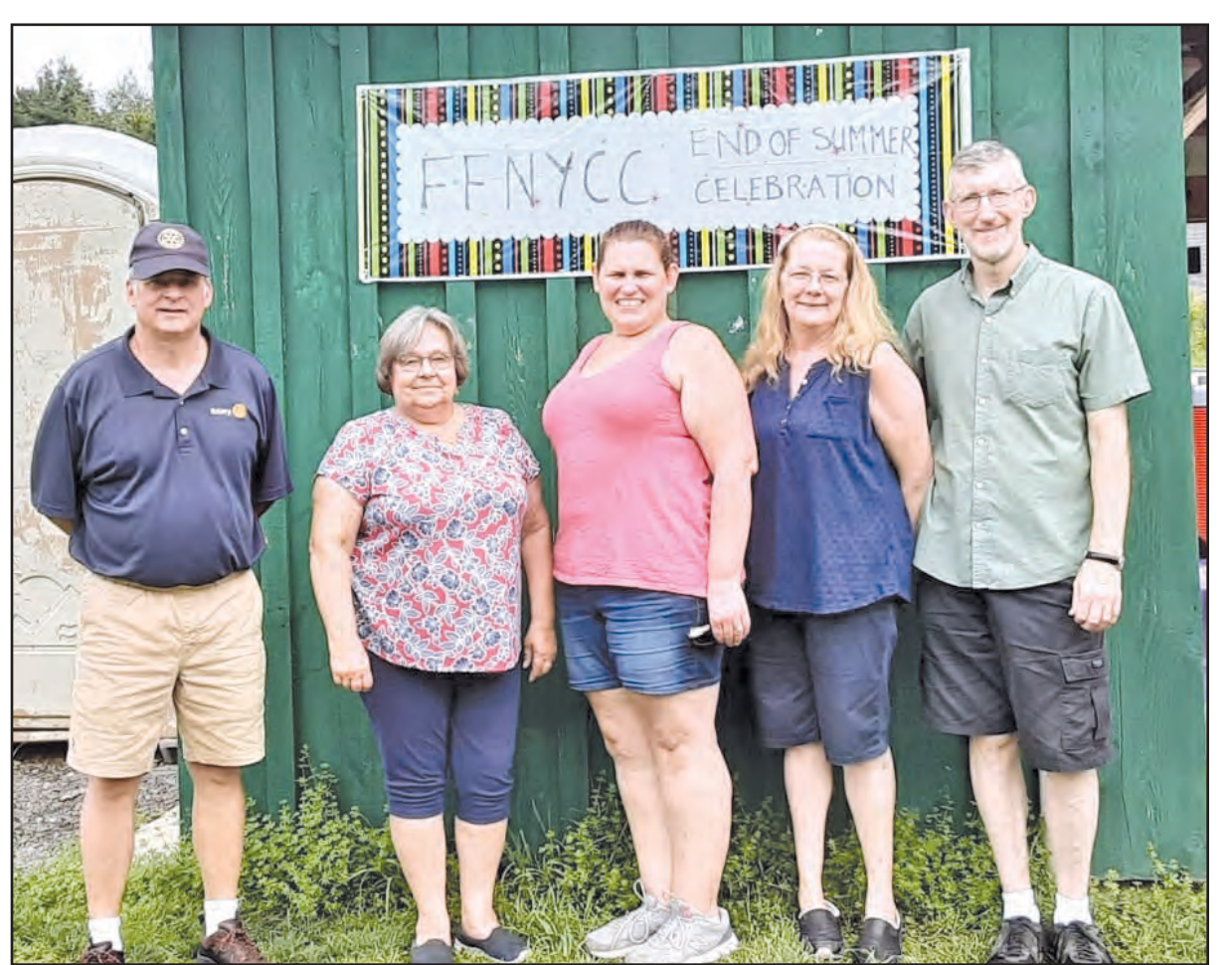
Throughout 2022 Fostering Futures Volunteer Teams provided emotional support, helped with practical household tasks, and even assisted with life skills training including budgeting, job seeking, and cooking.