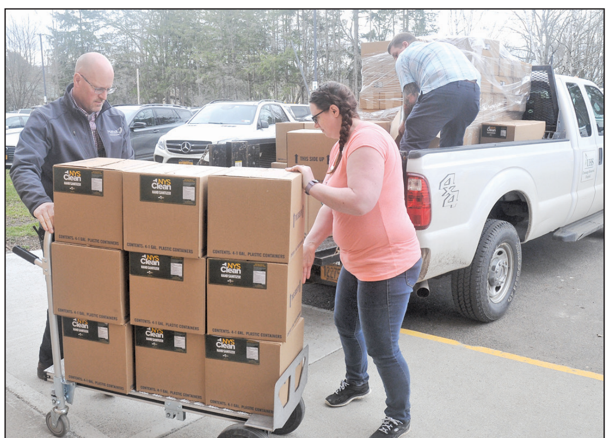
Chenango Memorial Hospital staff unload cases of hand sanitizer and other needed supplies provided by Chenango County's Emergency Management Office in April 2020.