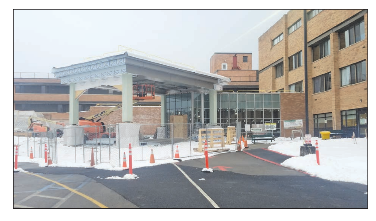
We are pleased to announce that we are now the:

Despite the pandemic, improvements are underway at the Norwich hospital. The hospital started 2020 on an optimistic note, celebrating the success of the Chenango Medical Neighborhood Capital Campaign raising more than $6 million, representing the largest concentrated investment in the healthcare facility in more than 50 years.