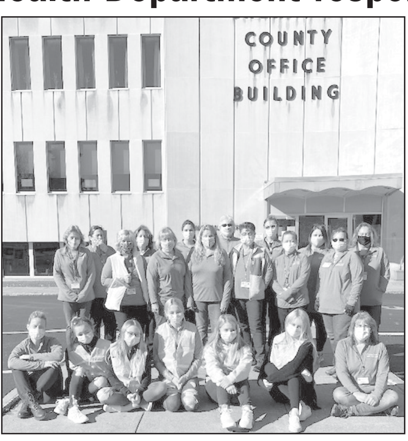
The Chenango County Health Department's nursing team during their drive thru flu clinic in the fall of 2020.

Anyone in close contact with a person who has been infected is also contacted. Health officials He said there is no refer to the initially diag-