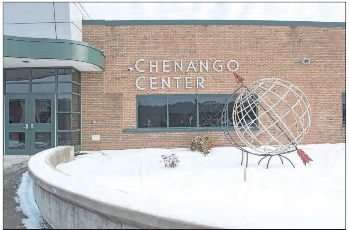
More than 12,000 students in the region are educated thanks to the efforts of DCMO BOCES and its staff.

Connecting students to local jobs and careers provide a proactive alternative to retaining young people building active lives in Chenango County. BOCES provides other support services