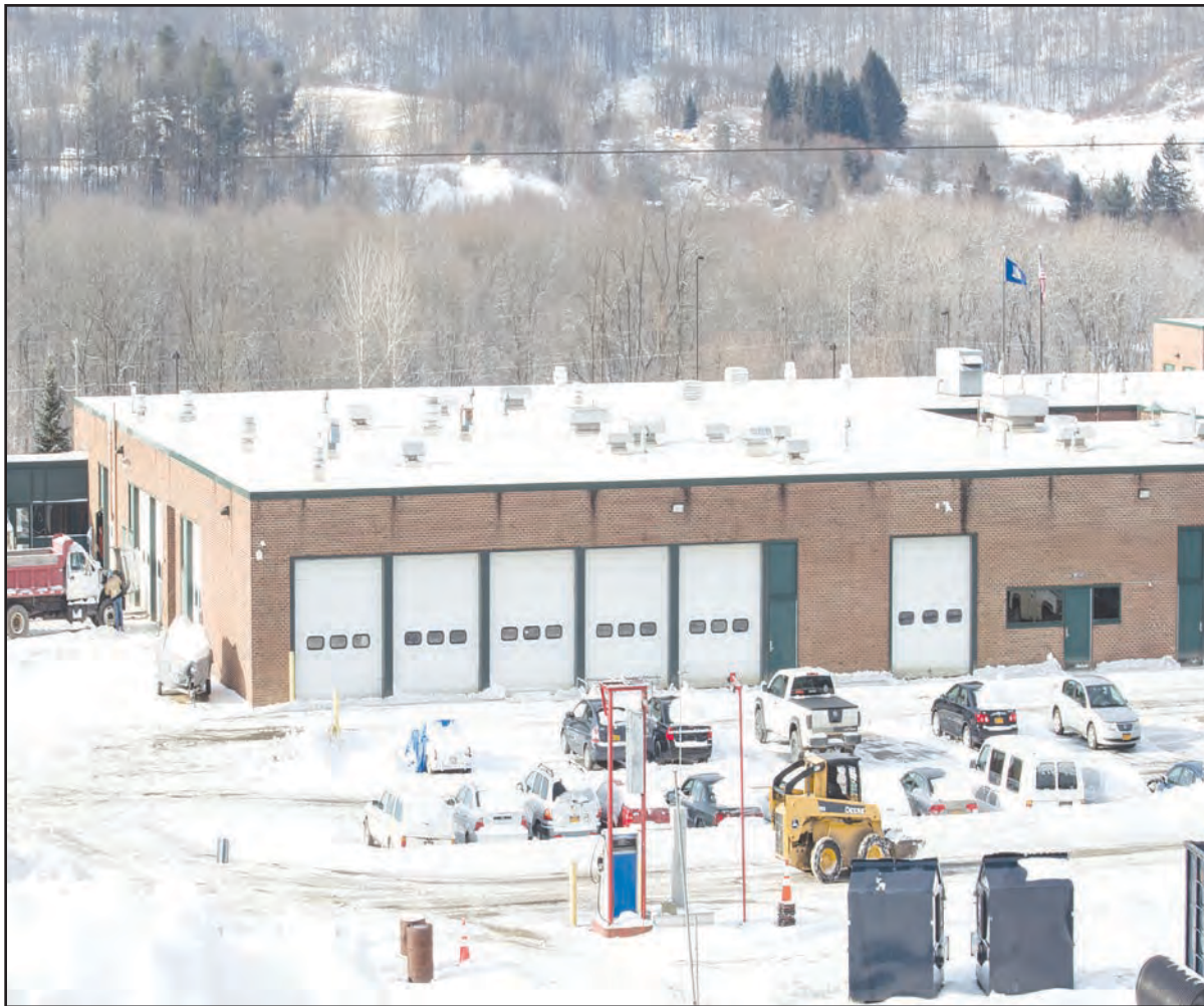
Students at DCMO BOCES have the opportunity to get hands on experience in 14 different career and technical education fields including Culinary Arts, Computer Technology, Automotive Technology, Health Occupations.