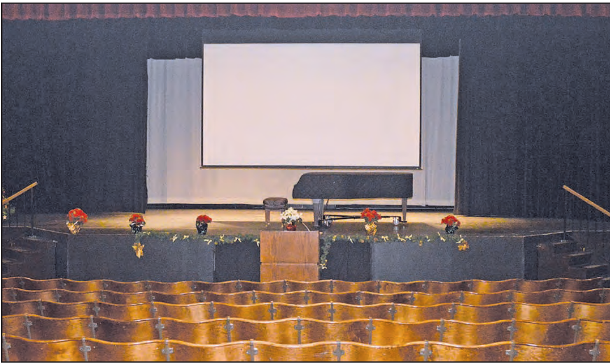
The Chenango Arts Council has many services, including the use of their space. The 500-plus seat theater has been rented for weddings, music video shoots, movie screenings, and much more.

to the grant program and then he will match up to $5,000. We've reached $3,000 in contributions already," said O'Neill. "It's been proven that having the arts in a classroom setting helps kids not only remember things and retain them but want to comeback for more."