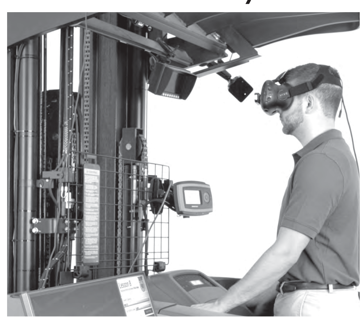
This simulator is a virtual reality headset that can plug into the newer Raymond forklift. When plugged into the forklift the headset automatically generates a a simulation for the driver to train on.

Continued from page 59 ing workers and was hoping to hire 100 employees altogether.