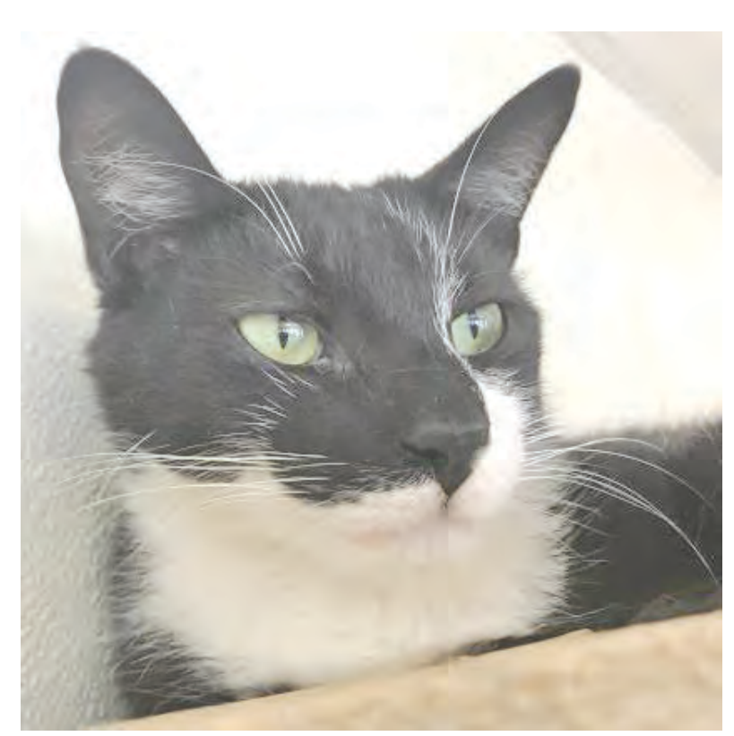
Beatle is a two-year-old cat that's been in Chenango County SPCA's kennels since July of 2017 and is still looking for a home.