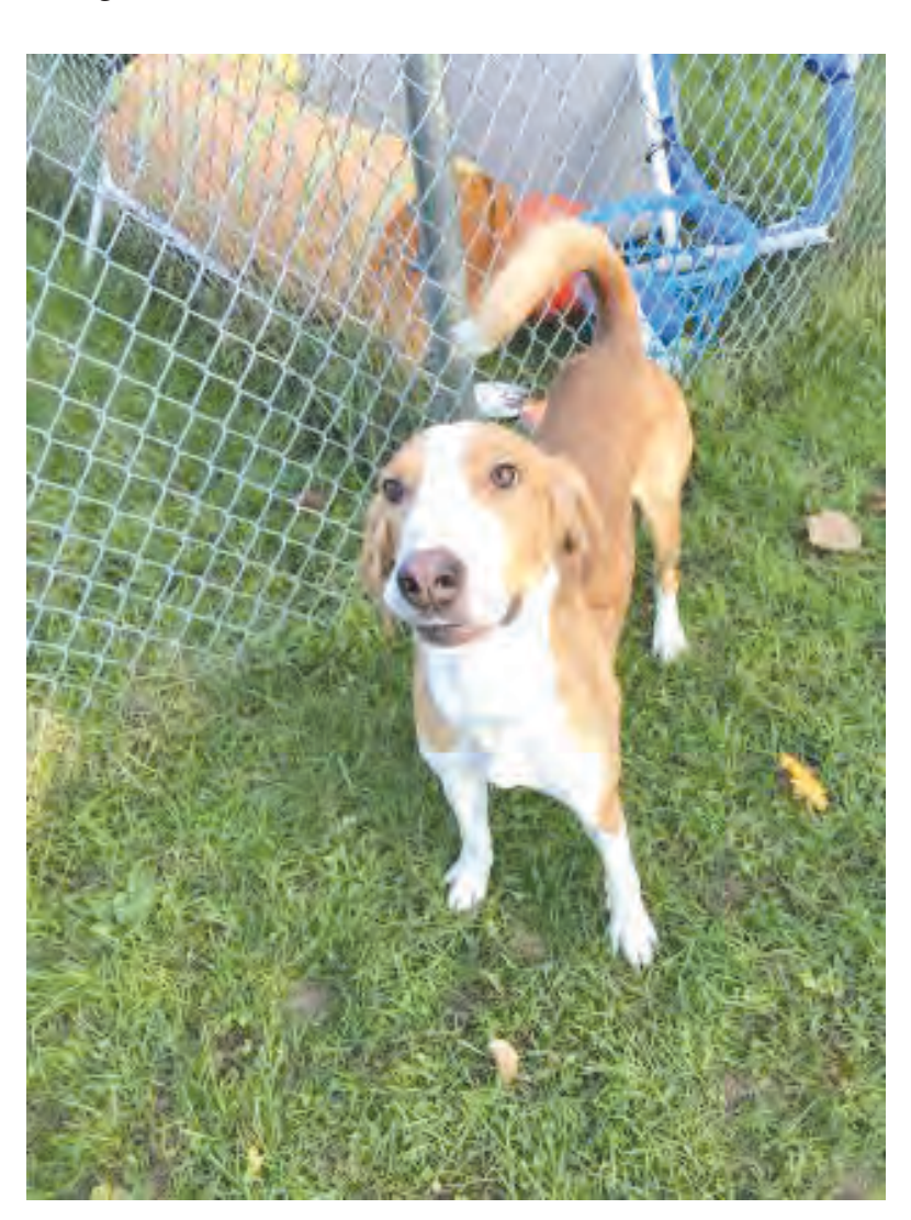
Boone is a 18 month old hound mix that has been looking for a home since June of 2018.

"We had a cat that appeared to have been hit by a vehicle as she had a completely dead leg not too long ago, and they ended up providing her treatment and saving her life thanks to the