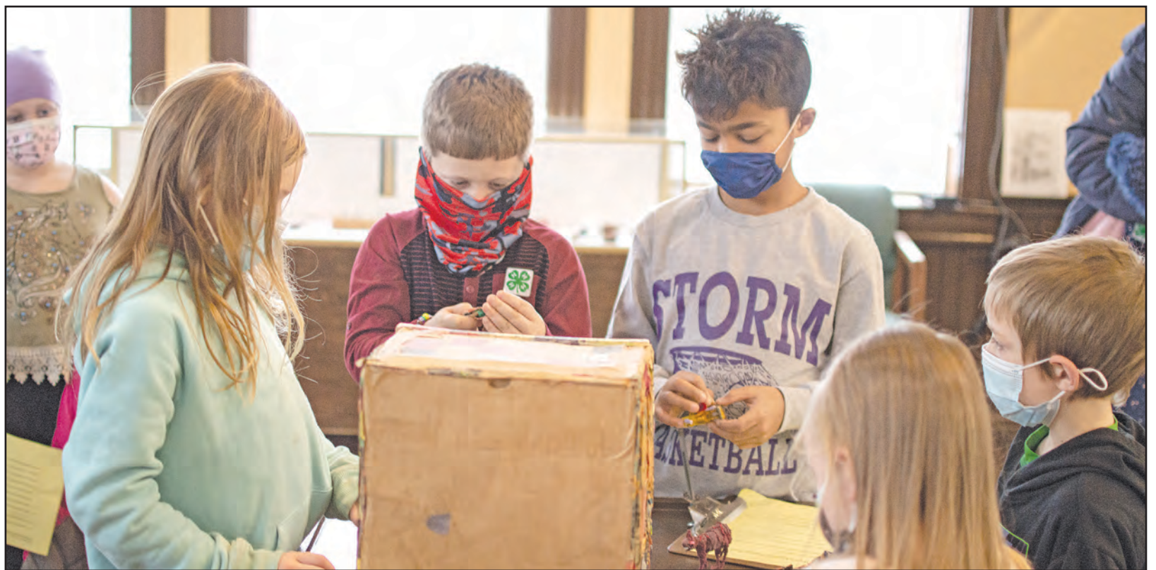
4-H youth toured the Chenango County Historical Society Museum in January of 2022 for the first time since the start of the pandemic.