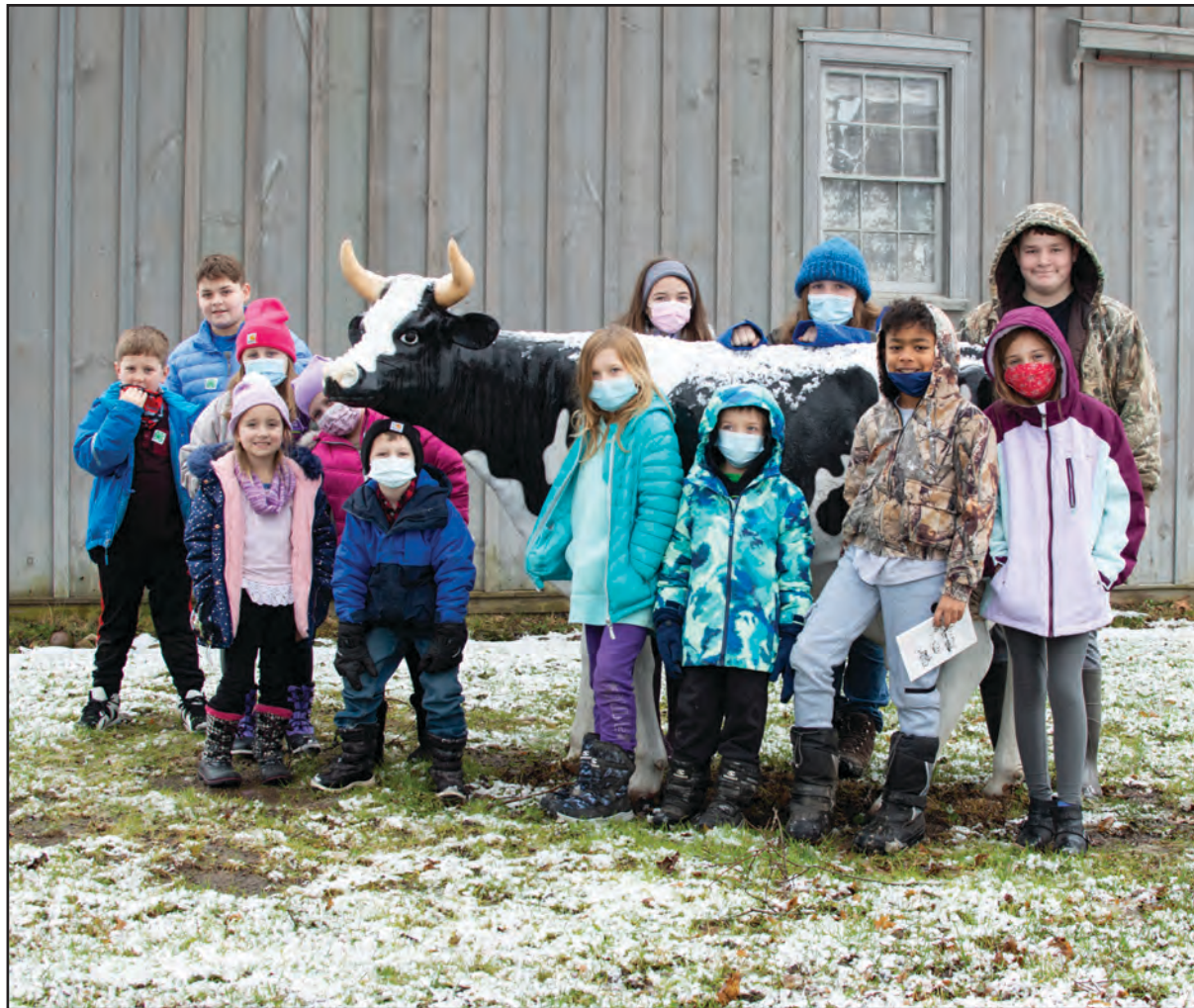
The historical society's museum is currently open with a number of exhibits highlighting history from around Chenango County.