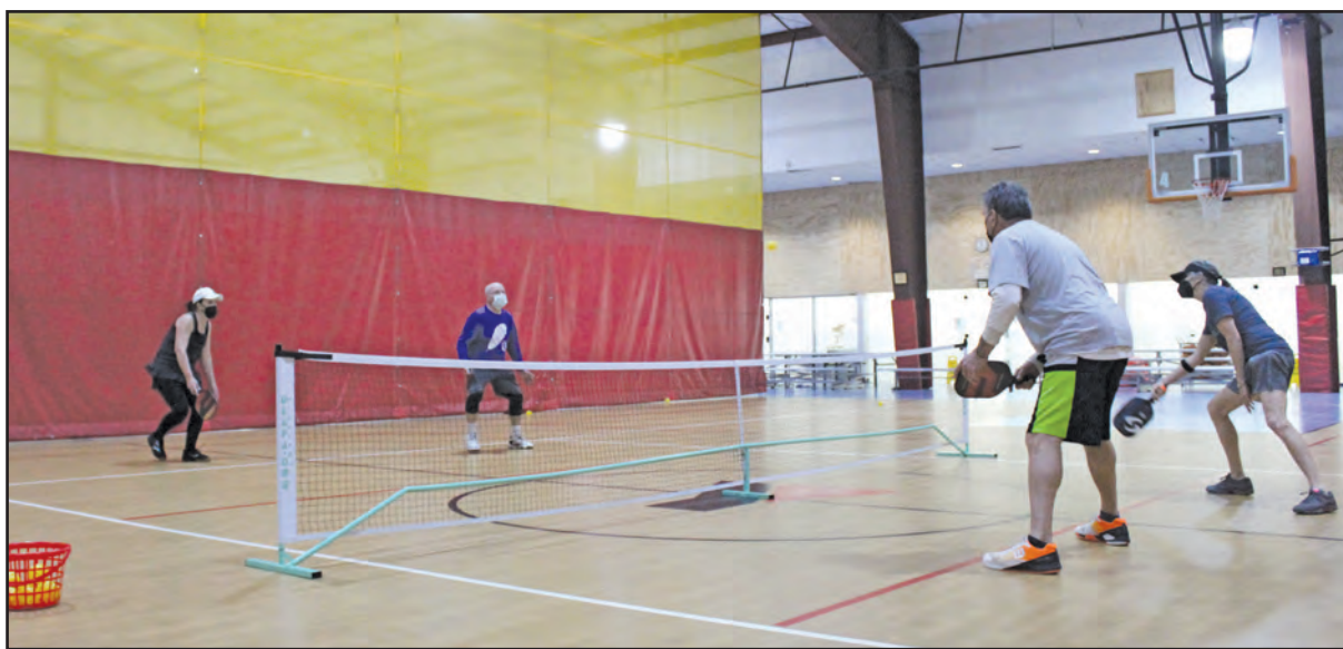
Norwich Family YMCA members enjoy a friendly game of pickleball in the YMCA gym.

Compounding that issue is the reduced space available at