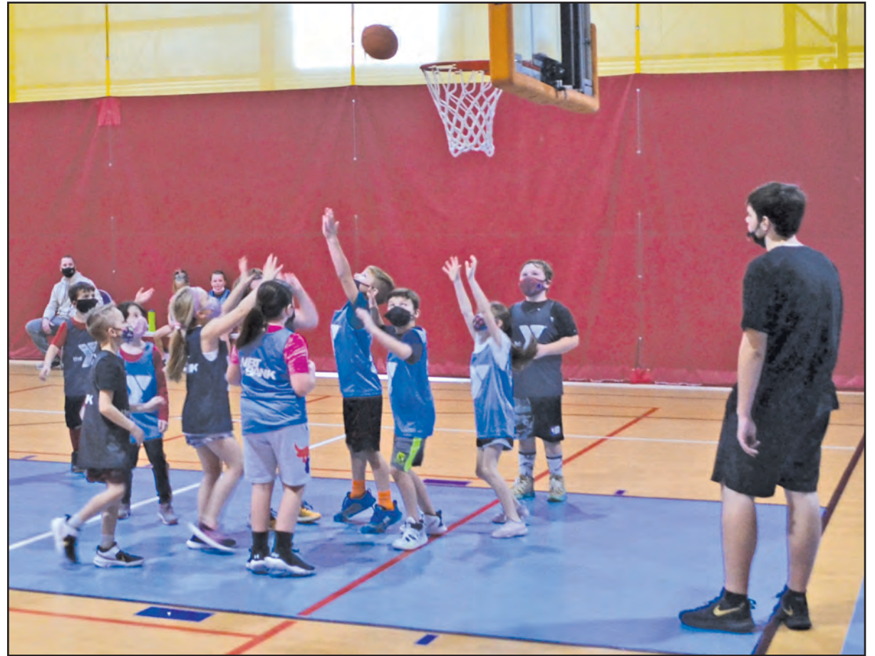
A kids' basketball tournament at the Norwich YMCA. The Y offers programs at their facility located at 68 North Broad Street in Norwich. The building houses a swimming pool, fitness center, three gyms, racquetball courts, the "Kids' Gym," and more.

"We continue to be a leader in childcare programming, sports programming and swim lessons for area youth," said Mullen. "We continue to pro-