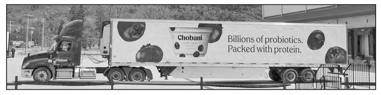
Chobani donated $200,000 to several different central NY community groups in November 2020. The Cornell Cooperative Extension of Chenango County received more than $63,000 for educational programs for farmers interested in establishing beef or sheep production.

"We've looked at things. We've prioritized things. We've done things differently," he said. "But all the while, we've kept true to our principles and values. It's not easy; it's hard work. It's expensive. It costs money to take care of our employees and to give back. But it's the right thing to do, and that's where we'll always be."