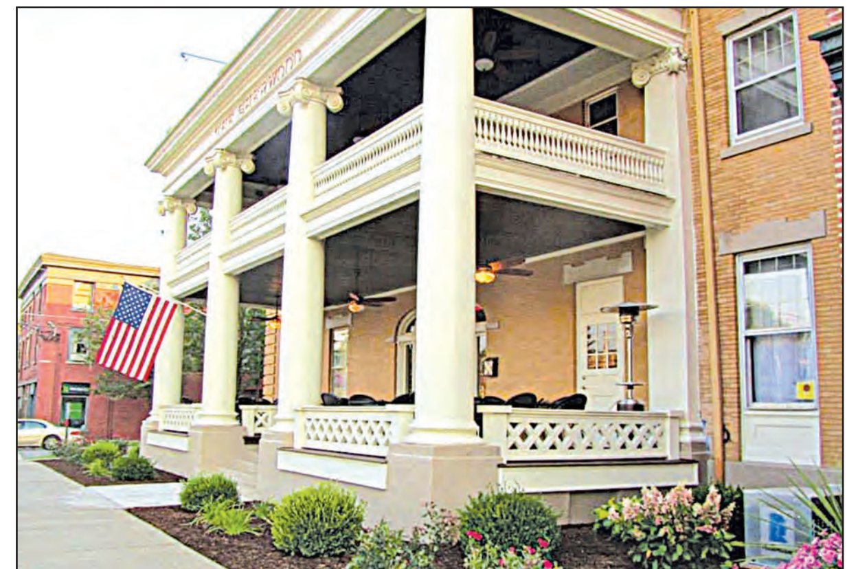
Despite a year of hardships for Greene's business district, the Sherwood Hotel – a notable landmark in downtown Greene - got a promising start under new ownership in 2020.