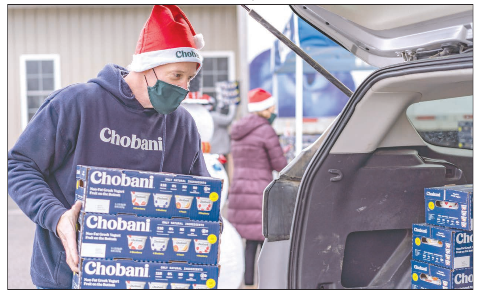
A Chobani employee helps load a vehicle with cases of Greek yogurt during the company's annual holiday giveaway at the fairgrounds in Norwich.